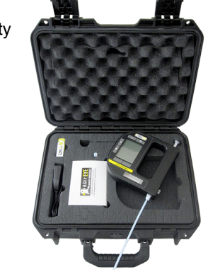
SG-Ultra Max Kit