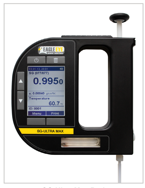
SG-Ultra Max Body